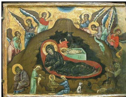
Guido da Siena, Nativity Italian, ca. 1270 Paris, Musée du Louvre

In early medieval images in both the East and the West Joseph, when he appears at all, is segregated from Mary and the Christ Child, even in Nativity images. Further, he is invariably shown not as a sturdy man in his prime, but as an old, indeed sometimes very old man.